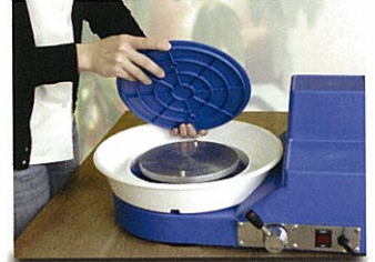
Includes a splashpan and two bats.

Easy to replace and remove. Adopting one-piece splashpan not to leak clay.