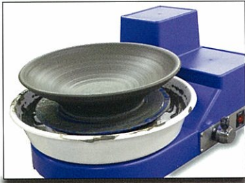
High-power unlike tabletop wheel. Easy to throw a large plate (300mm Dia.)

Shimpo's RK-5T, a tabletop potter's wheel can handle your most creative challenges. Its lightweight, compact design makes it easily portable; and yet its 10kg centering capacity makes it a permanent addition to any studio or classroom. The RK-5T includes a splashpan and two bats.